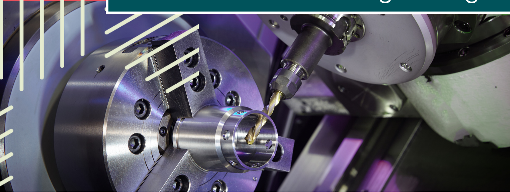
WLR Precision Engineering